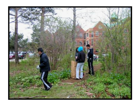
Secondary school students gain community service hours while they help in the garden

We are always looking for interested garden volunteers, both adults and students, to help with the spring cleanup of the flower beds. Students can earn community volunteer hours. April and May are the busiest months. We usually work (play) four Saturday mornings when the weather cooperates. If you would like to help us please contact: karsim@rogers.com.