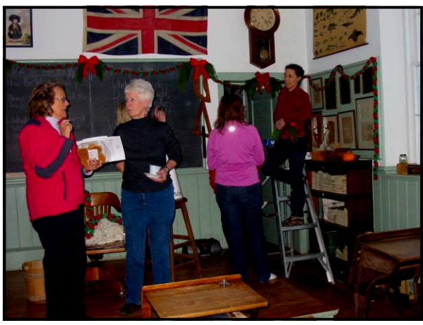
Decisions, decisions, decisions!